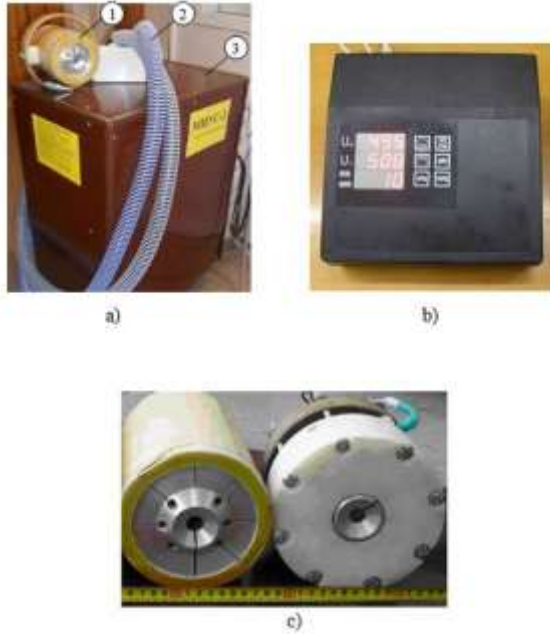
Fig.2. The technical implementation of the complex for the electromagnetic flattening the steel covering of the car body, a) the complex in the whole: 1 – is a tool for flattening; 2 – is the cable connection; 3 – is the power source (MPIS – 2, “the magnetic pulsed installation of the action series on 2 kJ”); b) the remote controller; c) the different tools for electromagnetic attraction of the dents on the steel covering.